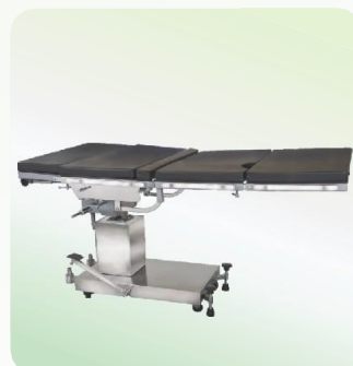
LATERAL TILT (LEFT and RIGHT)