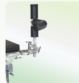
INNER THIGH SUPPORT WITH PAD