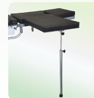
RADIOLUCENT HAND OPERATING TABLE