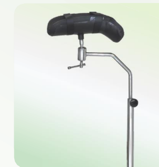
LOWER LEG SUPPORT