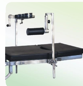
HAND TRACTION DEVICE