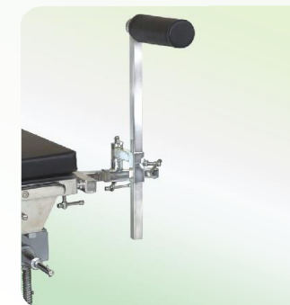
L-SHAPED KNEE REST WITH PAD