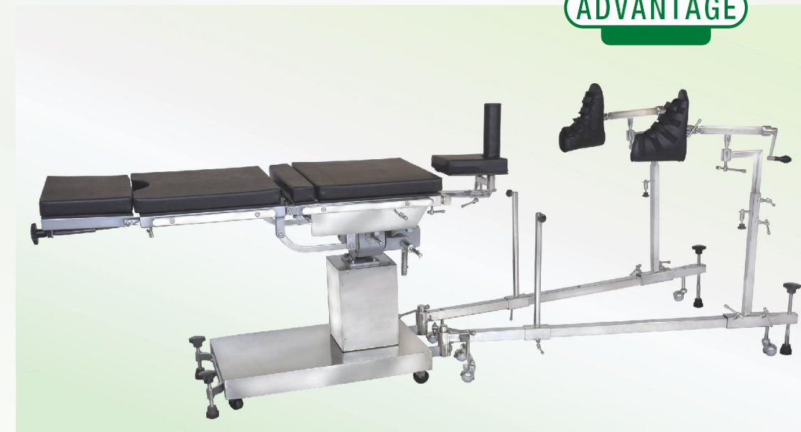
LEG TRACTION DEVICE - FLOOR MODEL TYPE