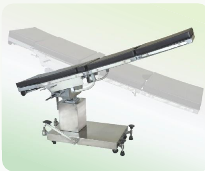
TRENDELENBERG / REVERSE TRENDELENBERG