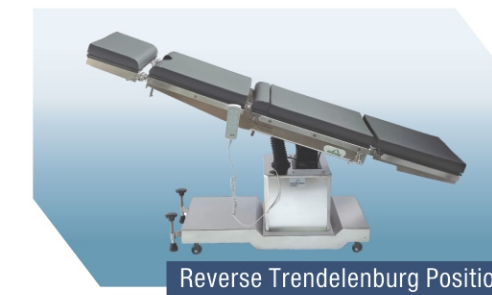
Reverse Trendelenburg Position