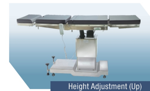
Height Adjustment (Up)