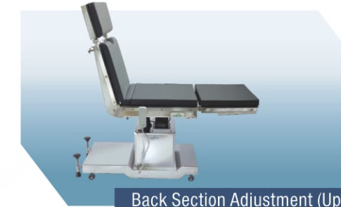
Back Section Adjustment (Up)