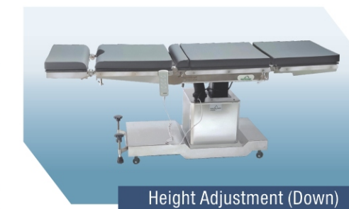
Height Adjustment (Down)