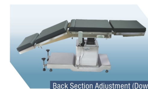
Back Section Adjustment (Down)