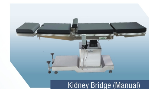
Kidney Bridge (Manual)