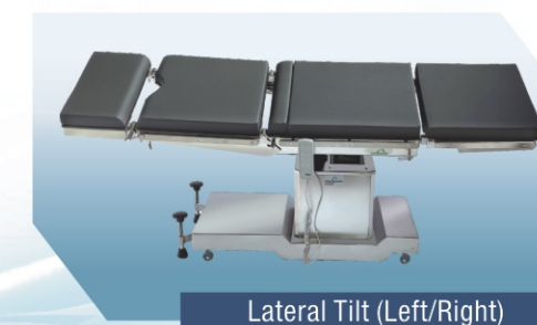
Lateral Tilt (Left/Right)