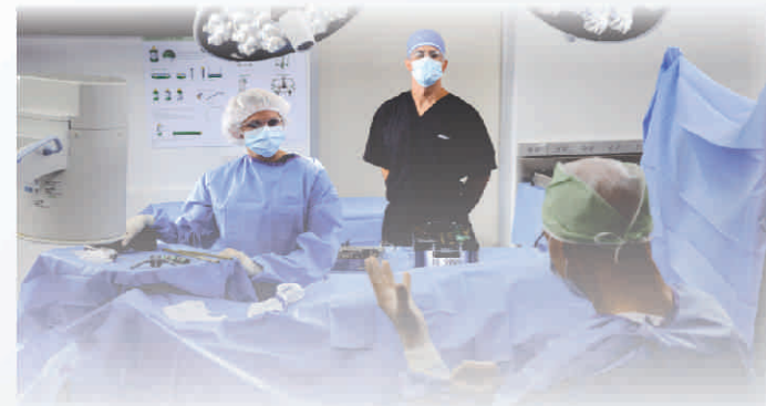
EMT-300 RISE by ADVANTAGE MEDICAL EQUIPMENTS is an affordable yet high quality Obstetric and Labour room operating table, specially designed to meet the requirement of Labour room.