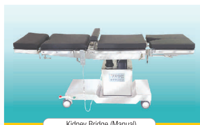
Kidney Bridge (Manual)

Operating table designed to obtain ideal operative posture and to cope with various surgical procedure ranging from microsurgery to general surgery.