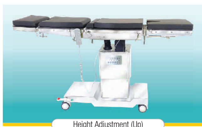
Height Adjustment (Up)