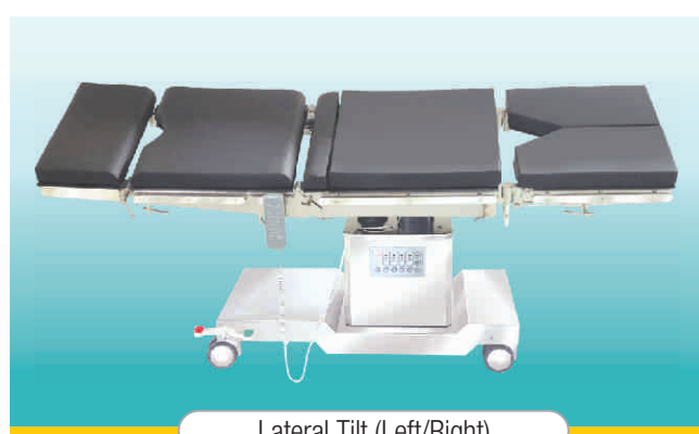
Lateral Tilt (Left/Right)