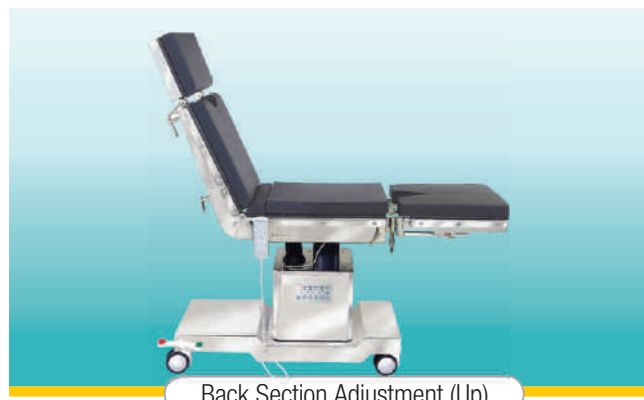
Back Section Adjustment (Up)