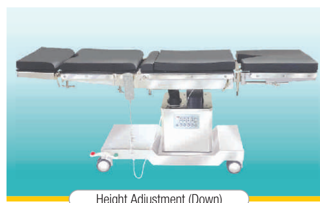
Height Adjustment (Down)