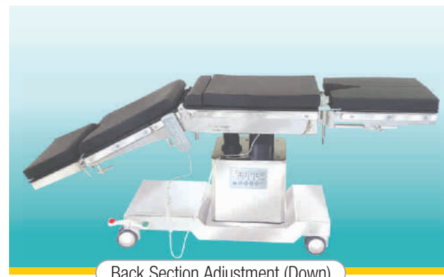
Back Section Adjustment (Down)