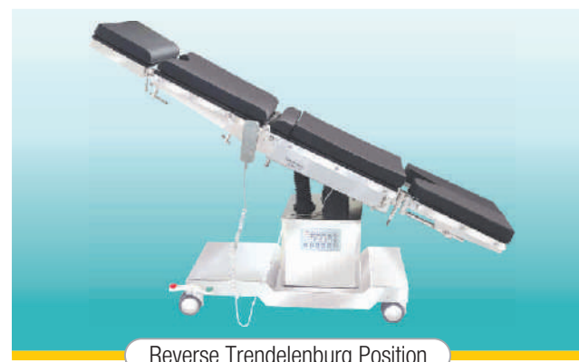
Reverse Trendelenburg Position